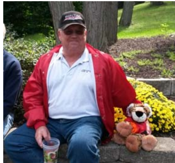
(Who knew he liked sitting amongst the pretty flowers?!)